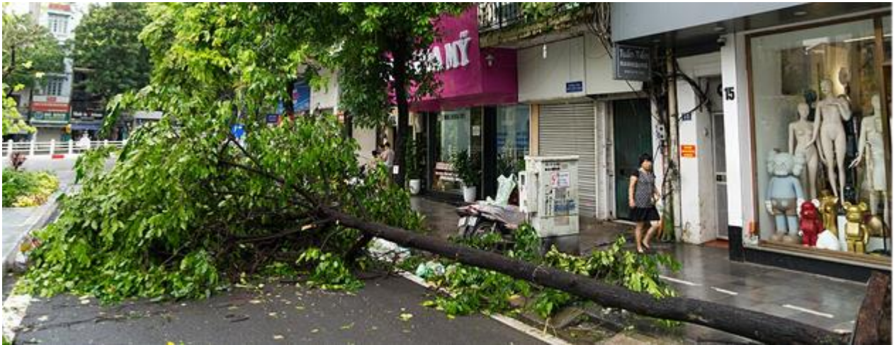
Above: Typhoon Yagi: Credit Octagon.

Asia's biggest typhoon of 2024, Super Typhoon Yagi (also known as Enteng), struck multiple countries in Southeast Asia in early September. It triggered 39 destructive landslides, severe flooding, and widespread infrastructural damage, particularly in the Philippines, Laos, Vietnam, Myanmar, and Thailand. Equivalent to a Category 5 40 hurricane, the typhoon reached peak wind speeds exceeding 200 km/h.