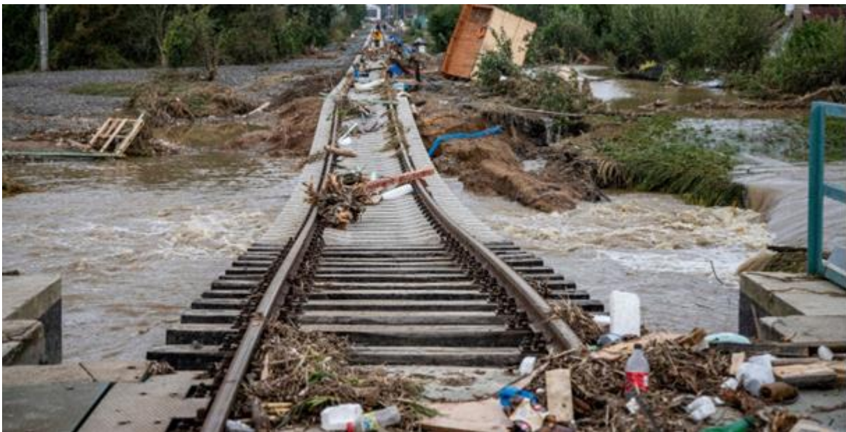
Above: Opava River.

Between 12 and 16 September, Storm Boris hit several countries in central and eastern Europe. During those days, massive amounts of rain fell across Austria, the Czech Republic, Germany, Hungary, Italy, Poland, Romania and Slovakia.