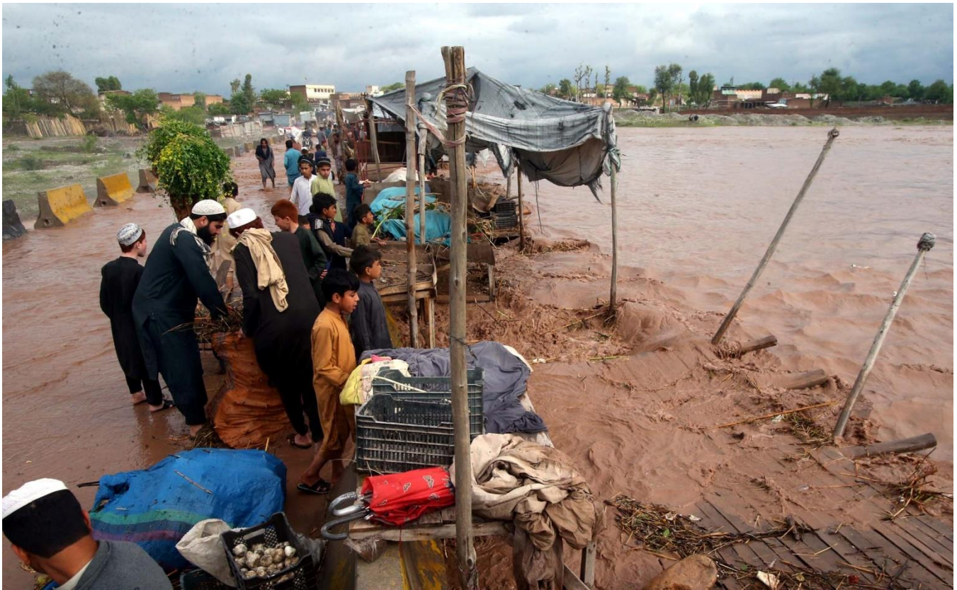
Above: Flooding in Peshawar, Pakistan.