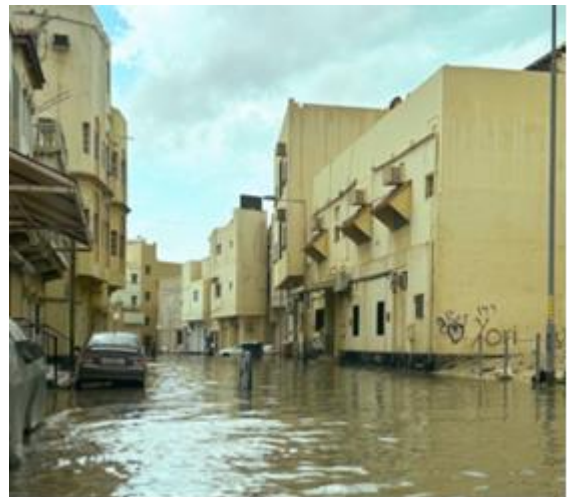
Above: A flooded road in the city of Muharraq, in the Kingdom of Bahrain. The location is close to the pearling path, a UNESCO World Heritage Site.

Other human caused factors such as widespread urbanisation, inadequate drainage and hyper-arid souls also made the situation worse, exacerbating the risk and severity of flash floods.