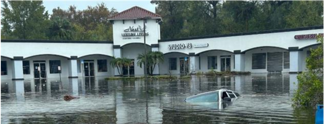
Above: Hurricane Milton.

In October, just two weeks after Hurricane Helene (see below), Hurricane Milton formed. Although it reached category 5 5 , it made a landfall in the Florida peninsula as a category 3 storm, unleashing tornadoes and severe flooding not only in the US but also in the Yucatan Peninsula and the Caribbean.