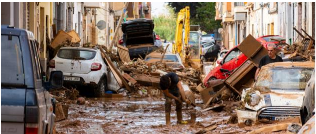
Above: After the floods in Valencia, a person empties a bucket full of mud taken from his house into the street. Cars and debris in the street.

Warm sea surface temperatures fuel storms 86 , as warm waters create moisture in the air and can lead to stronger events. A third analysis 87 , this one by Climate Central, found that around the time of the event, the elevated sea surface temperatures that fuelled the storm that caused the Valencia floods were made 50-300 times more likely by human-caused climate change.