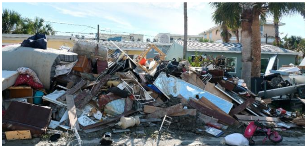
Above: Damage along the Pinellas County beaches from Hurricane Helene is extensive in neighbourhoods all along Gulf Boulevard.

Climate change is making hurricanes more intense. A study 28 by WWA found that climate change made the storm about twice as likely, increased rainfall by 20-30% and made wind speeds around 10% stronger. Another analysis 29 by Climameter also found the fingerprints of climate change in the event, estimating that global warming increased rainfall by up to 20% and wind by around 7%.