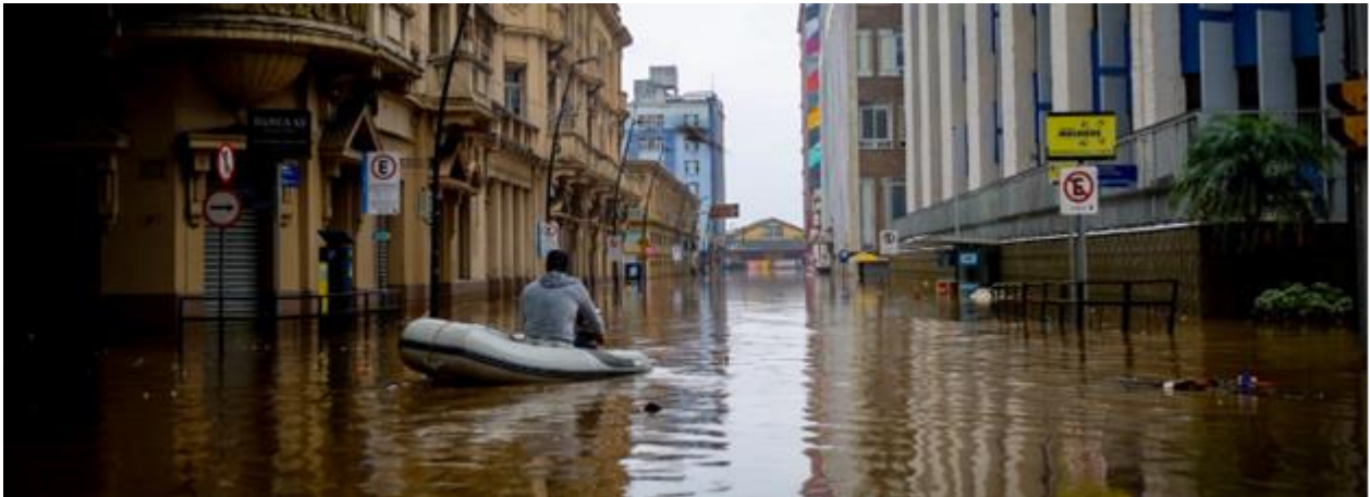
Above: Brazil floods.

Between late April and mid-May, the state of Rio Grande do Sul in Brazil experienced record rainfall, measuring three times higher 65 than the average for this time of the year. Nearly half 66 of all the state capital's neighbourhoods were flooded. The state governor, Eduardo Leite, called the extreme weather event the "worst disaster" in the state's history.